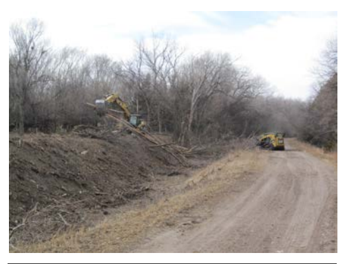
(2012): Photos shows tedious process that was required to remove the massive over-growth of trees along the canal.

Engineering Firm- Miller & Associates of Kearney, NE.