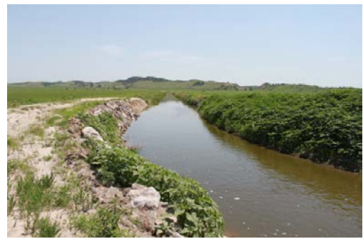
(Spring 2014): Completed section of canal holding water.