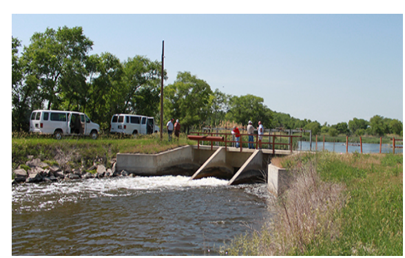
(Spring 2014): Headworks during PBHEP tour of the canal.